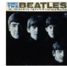
Meet the Beatles, album cover. 1964. Motion...