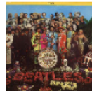
Sgt. Pepper's Lonely Hearts Club Band, album...